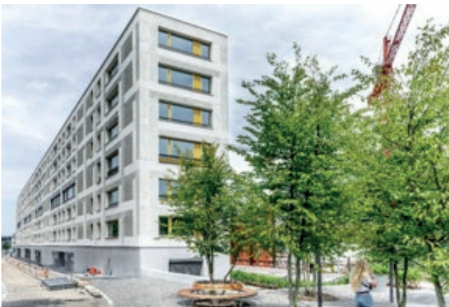
Greencity eco-district (Zürich Switzerland)

https://www.wwf.fr/champs-daction/climat-energie/reinventer-villes