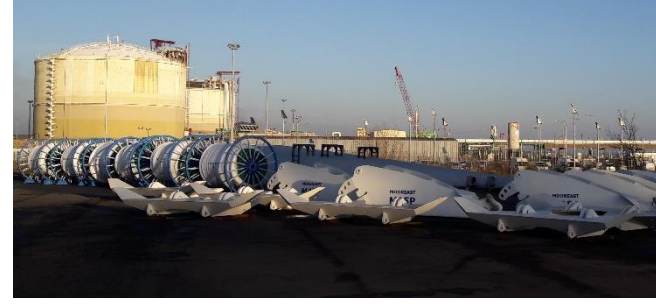
Foreground: anchors Background: reels of nylon mooring lines

The mooring system will be pre-installed at sea on the SEM-REV site in spring 2017.