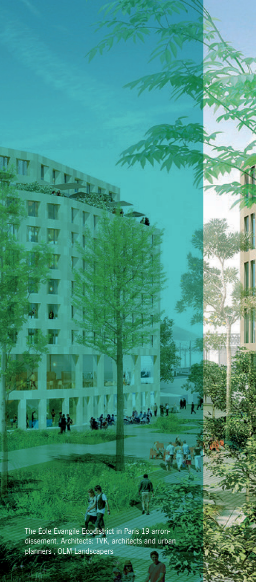
The Eole Évangile Ecodistrict in Paris 19 arrondissement. Architects: TVK, architects and urban planners, OLM Landscapers